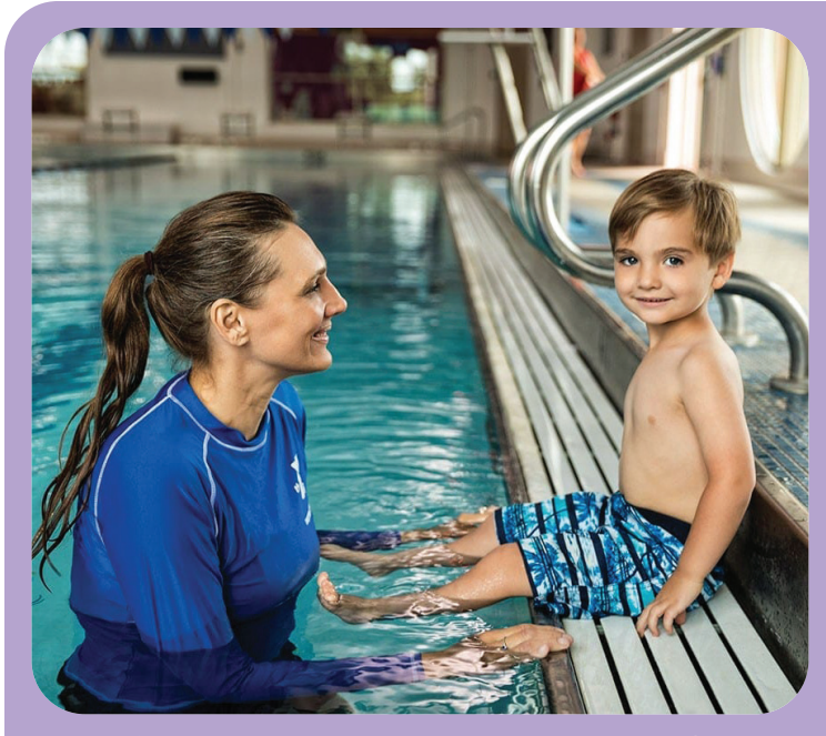
Parents: A swim evaluation is needed prior to registration for new students except for Polliwog.